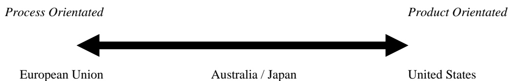
Figure 3 – The GMO Regulatory Continuum

In contrast to Australia's approach, the Japanese government has opted to address GMOs through existing regulatory agencies and revised regulation for risk assessment and labelling. 90 The Ministry of Agriculture, Forestry and Fisheries (MAFF) and the Ministry of Health, Labour and Welfare (MHLW) are the principal regulatory bodies for GMOs within Japan. However, no individual ministry has the power to coordinate the different ministerial activities, resulting in inevitable regulatory overlap. 91 Although the Japanese ministerial risk assessment guidelines are based on Organisation for Economic Co-operation and Development (OECD) guidelines of "'familiarity' and 'substantial equivalence,'" 92 Bailey suggests that "in general, the Japanese regulations regarding 'GMO' foods and food ingredients are much closer to the more restrictive E.U. regulations than is the more open U.S. Food and Drug Administration (FDA) approach." 93 Bernauer, on the other hand, suggests that the Japanese regulatory approach represents the middle ground between the E.U. and the U.S. approaches, 94 as illustrated by Figure 3.