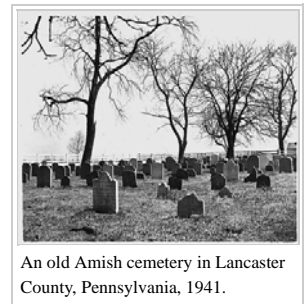
An old Amish cemetery in Lancaster County, Pennsylvania, 1941.