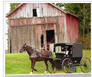
Amish couple in horse-driven buggy in rural Holmes County, Ohio, September 2004