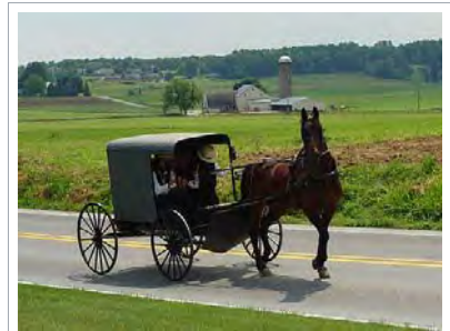
An Amish family riding in a traditional Amish buggy in Lancaster County, Pennsylvania