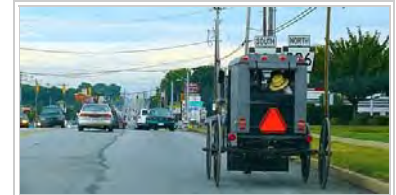
Traditional Amish buggy, Lancaster style