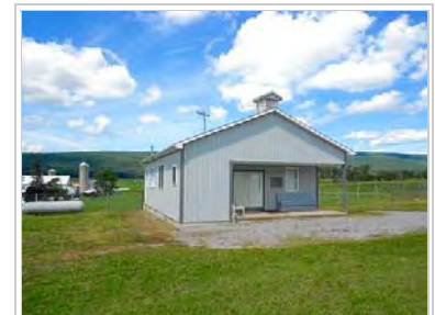
Amish school near Rebersburg, Pennsylvania