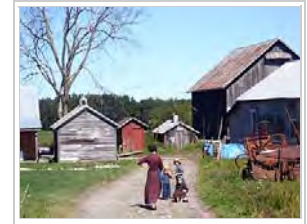
An Amish farm near Morristown in New York State