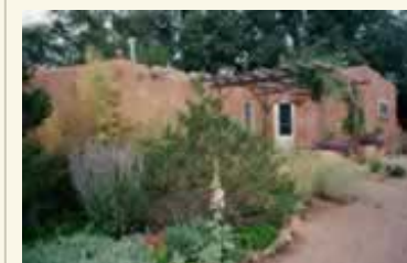
El Rancho Nido de las Golondrinas, Lemitar, NM Living History Farm Herb Garden