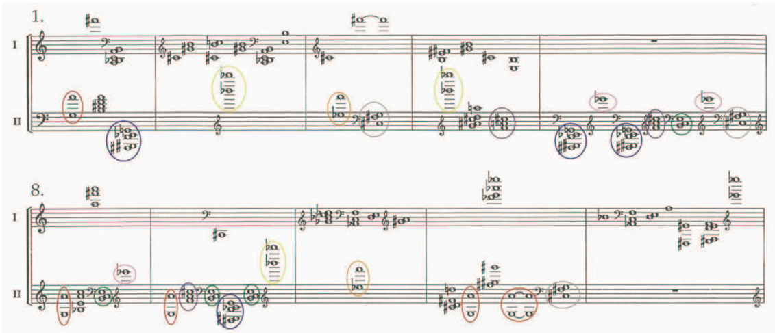
Figure 5: Two 2 , Sections 1 and 8.

Copyright © 1989 by Henmar Press, Inc. Reproduced by kind permission; all rights reserved.