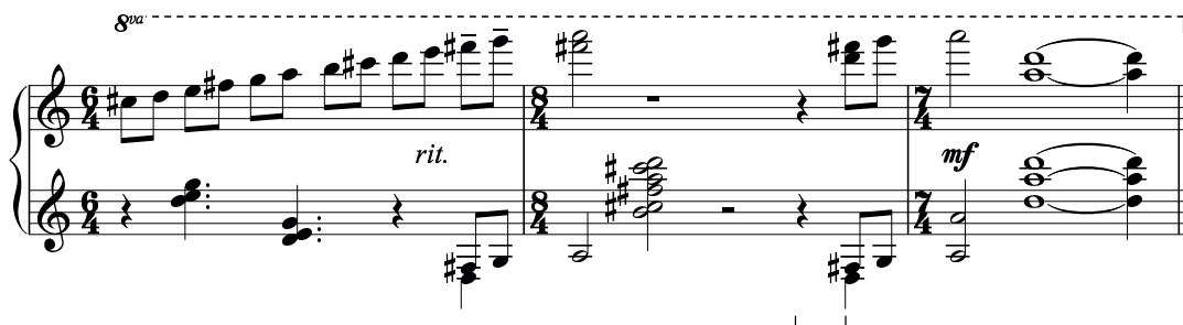
Figure 4: Sonata XII from Sonatas and Interludes , mm. 46–48.

Copyright © 1960 by Henmar Press, Inc. Reproduced by kind permission; all rights reserved.