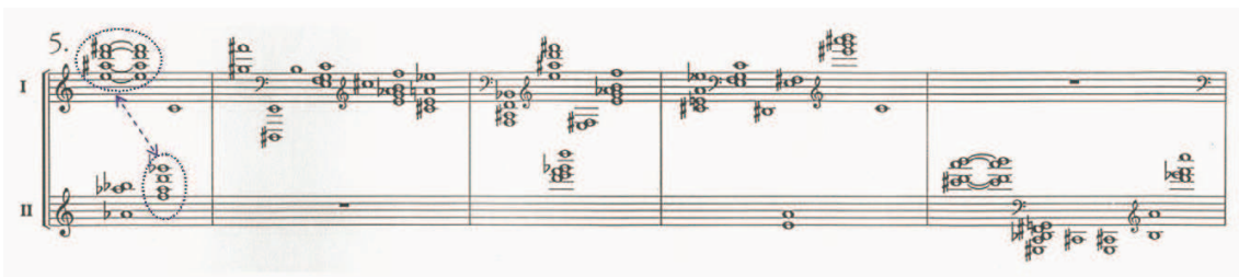
Figure 6: Two 2 , Section 5.

Copyright © 1989 by Henmar Press, Inc. Reproduced by kind permission; all rights reserved.