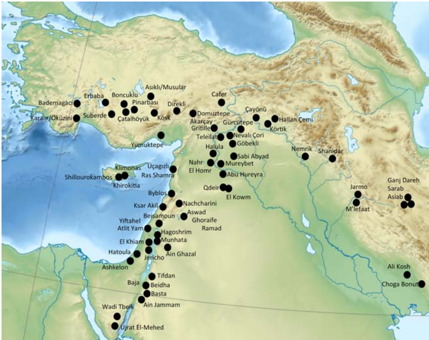
Figure 1. Map of Southwest Asia showing the location of sites mentioned in the text.

forms of management (Hadjikoumis 2012; Vigne et al. 2011; Zeder 2006). Instead, morphological changes can be expected to vary, not according to the presence or absence of human control, but rather depending on a constellation of issues including the intensity and type of management (i.e., free-range, herding, penning, etc), selective breeding, degree of inter-breeding with wild populations, and the genetic history of an animal population (e.g., feralization).