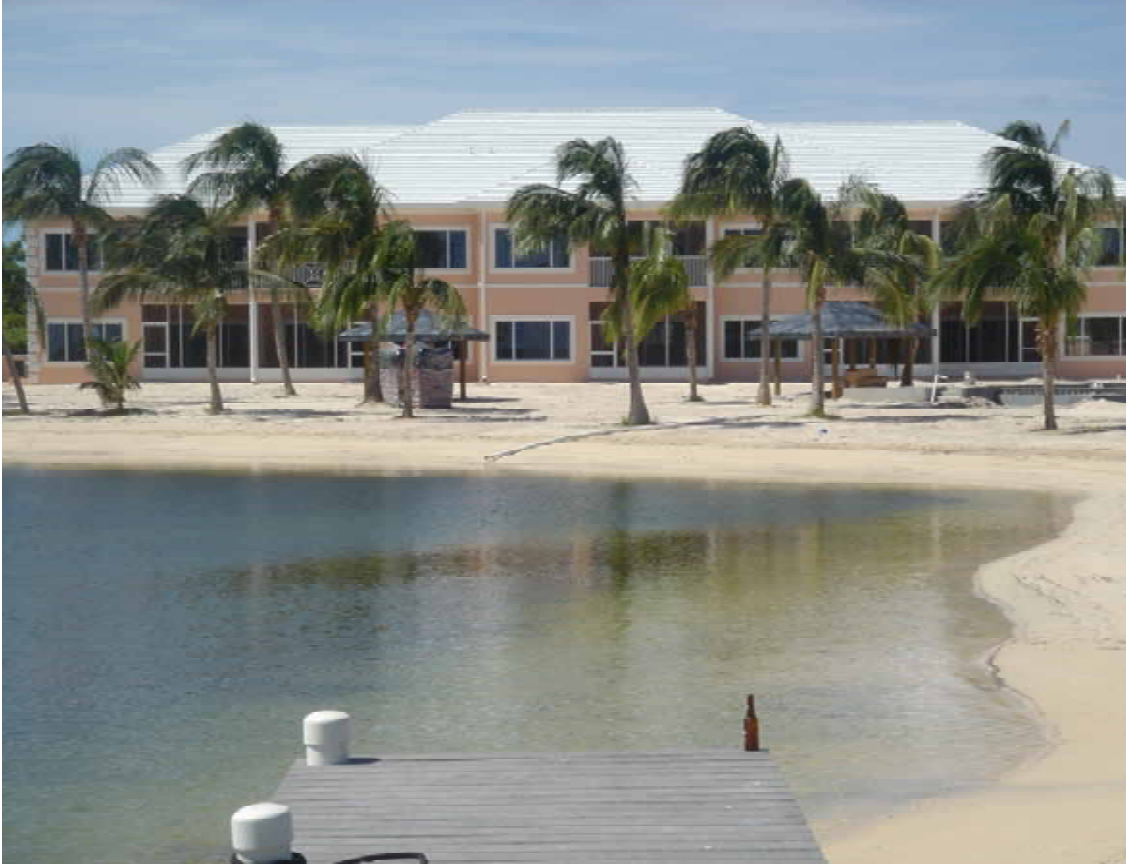
Fig. 6. New, highly vulnerable condominiums being constructed in the Cayman Islands in 2005.

Within a year after the Cayman Islands was devastated by Hurricane Ivan these condominiums are being built in close proximity to the sea. This is a highly dangerous development: