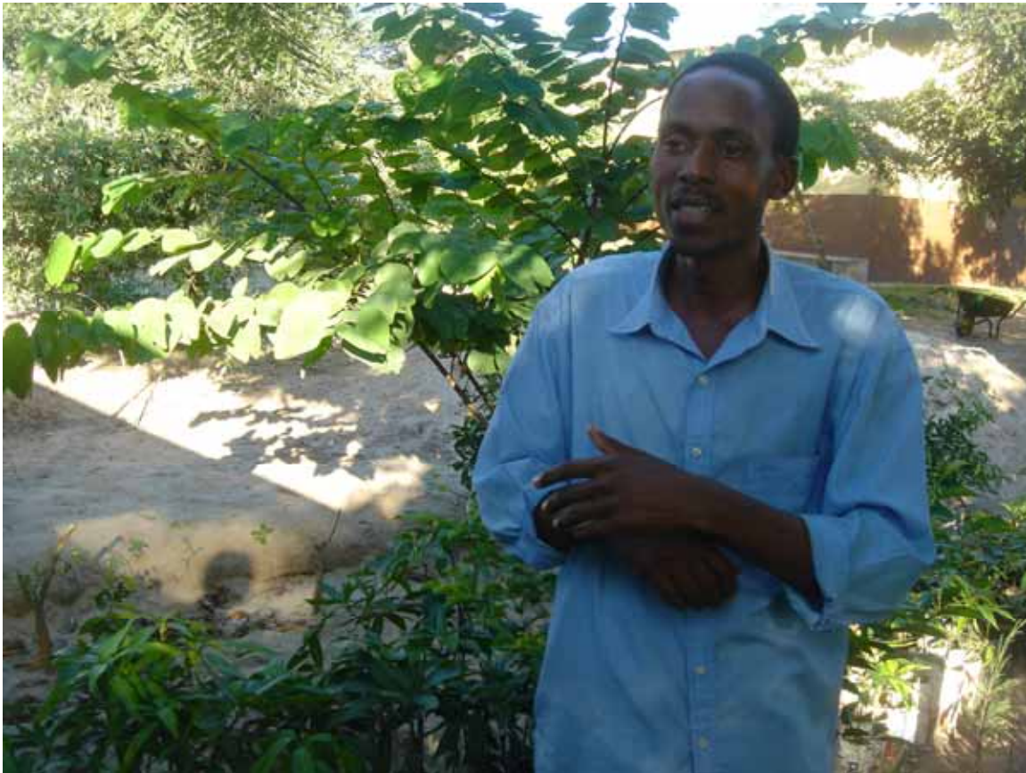
Fig. 11. Agricultural Extensionist in Mozambique with responsibility for assisting residents of a relocated settlement to plant nutritious fruit trees and vegetables in the gardens of their homes.

Following the 2000 flooding the Government of Mozambique, working with various international NGO's relocated over 45,000 people into new settlements. Each displaced family was allocated a small house of about 30 square metres with a large garden. In an