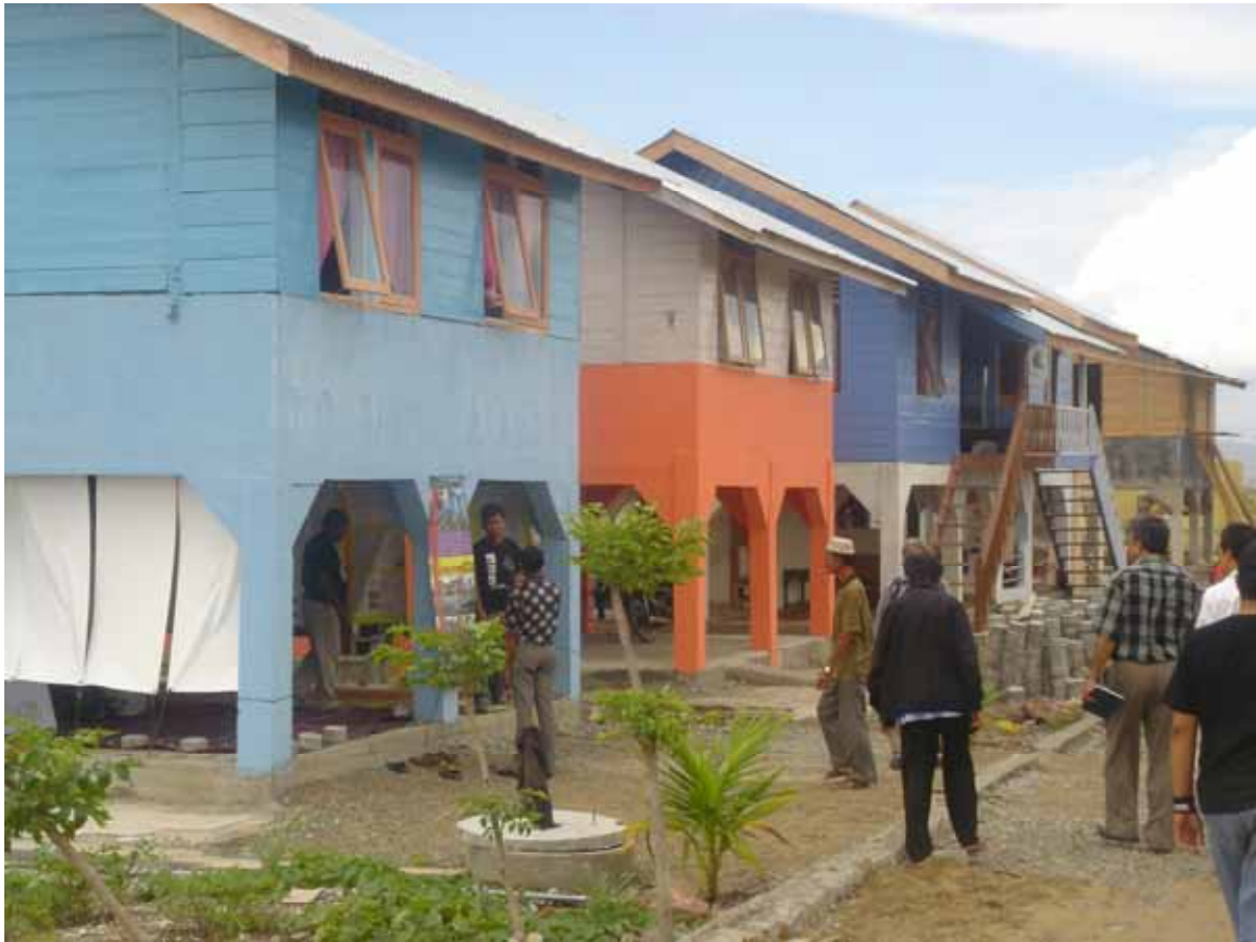
Fig. 10. ‘Owner-Driven’ Permanent Houses in Ache, Indonesia as an example of well integrated recovery

The construction of these houses was a joint product of a local community working with the support of UPLINK, a National Indonesian CBO. The provision of these houses for a community living in a coastal area of Ache strengthened four key recovery sectors: