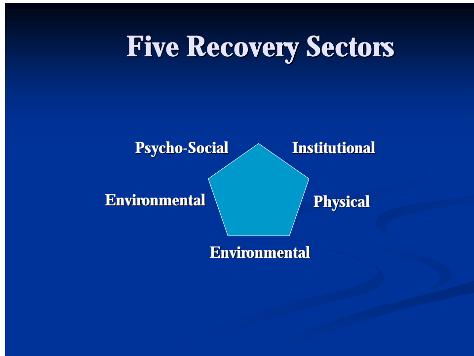
Fig.9. Integrated Recovery Sectors

The overall philosophy of the International Recovery Platform (IRP) is to promote a five part fully integrated recovery process: rebuilding the local administration and damaged local institutions as well psycho-social, physical, economic and environmental recovery.