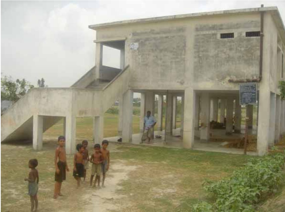
Fig. 5. Community flood shelter constructed by the Government of Bangladesh following severe 2004 flooding