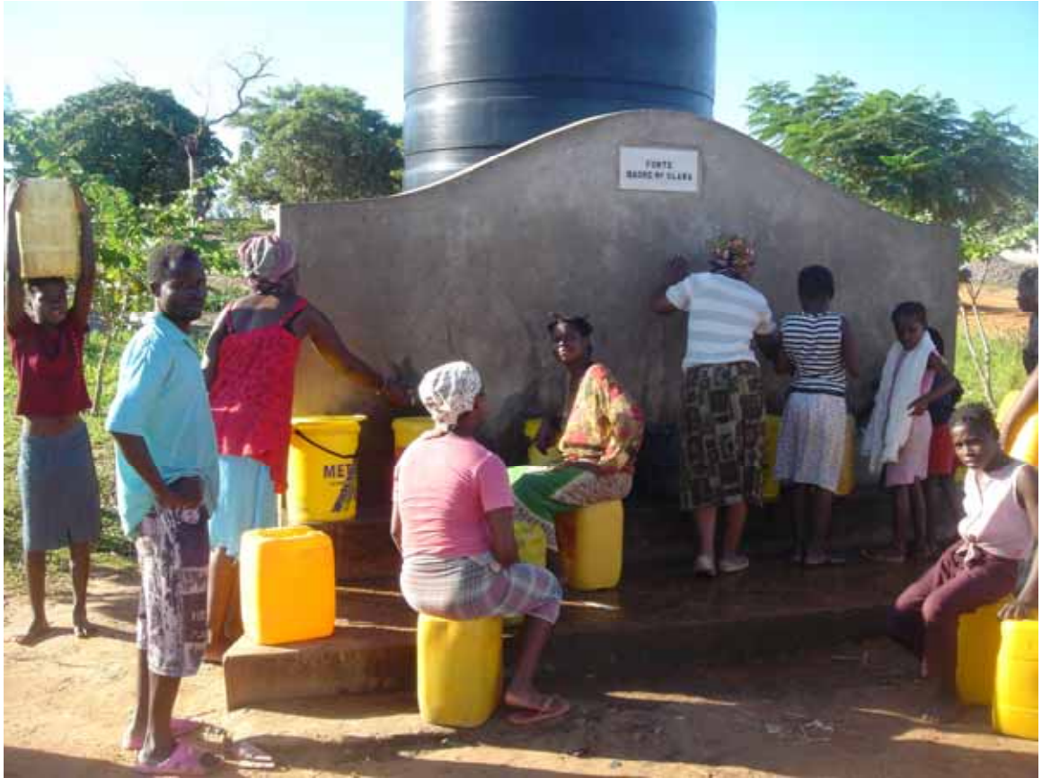
Fig. 7. Water collection in a relocated settlement in Maputo, Mozambique