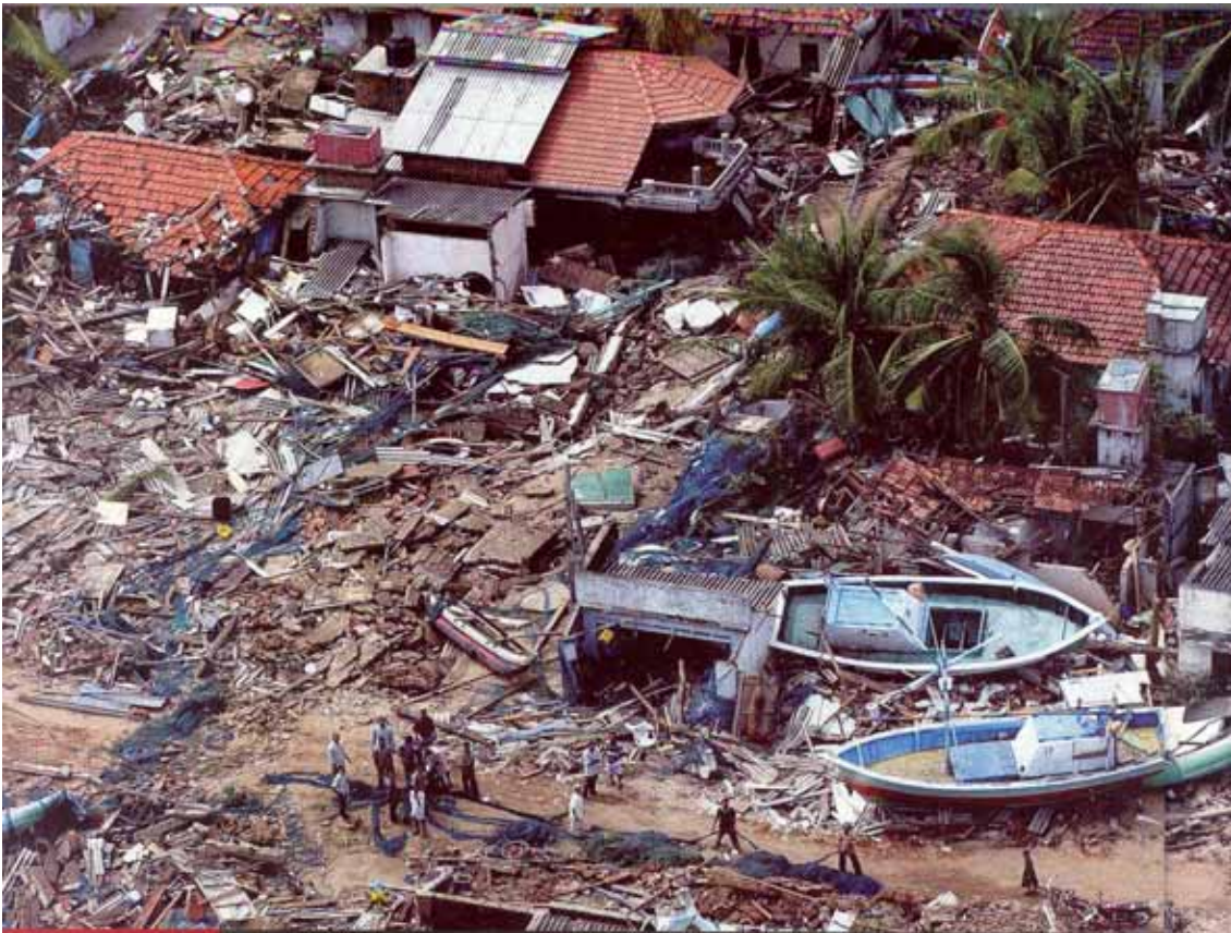
Fig 1. Tsunami devastation in Sri Lanka

Within this image the scale and complexity of disaster recovery is revealed: