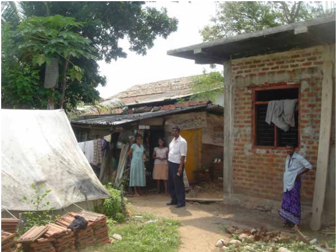
Fig. 8. Three phases of post-tsunami shelter in Sri Lanka: the continuum from emergency shelter to permanent dwelling.

In recent years a new concept has been introduced into the disaster response community: 'Linking relief, rehabilitation and development' (LRRD) this chapter will explore some of the dynamics in this progression that remains a complex challenge. Various issues will be considered, such as the culture of relief and humanitarianism of relief officials and how this relates to the developmental community, with different values and traditions, since both groups are present in the same recovery situation. A key question relates to what effect early decisions, taken in the immediate aftermath of a disaster, have on long term recovery? Is recovery best regarded as a single process, or a sequence of connected (or disconnected) phases?