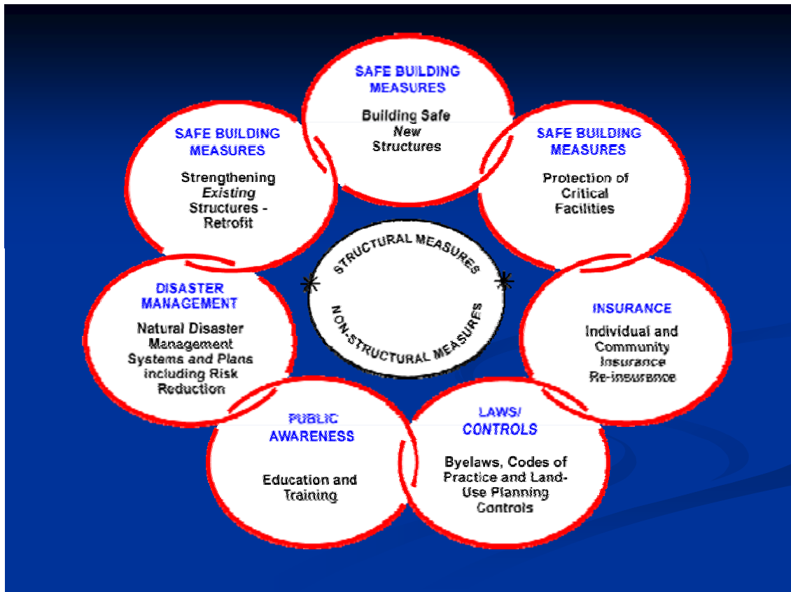
Fig. 4. The Chain of Safety

A 'chain of safety' model is proposed comprising the various risk reduction elements in a picture that seeks to emphasise the mutual interdependence of the varied aspects of risk reduction as well as the reality that a chain 'is only as strong as its weakest link'. Thus emphasising the importance of all the safety measures.