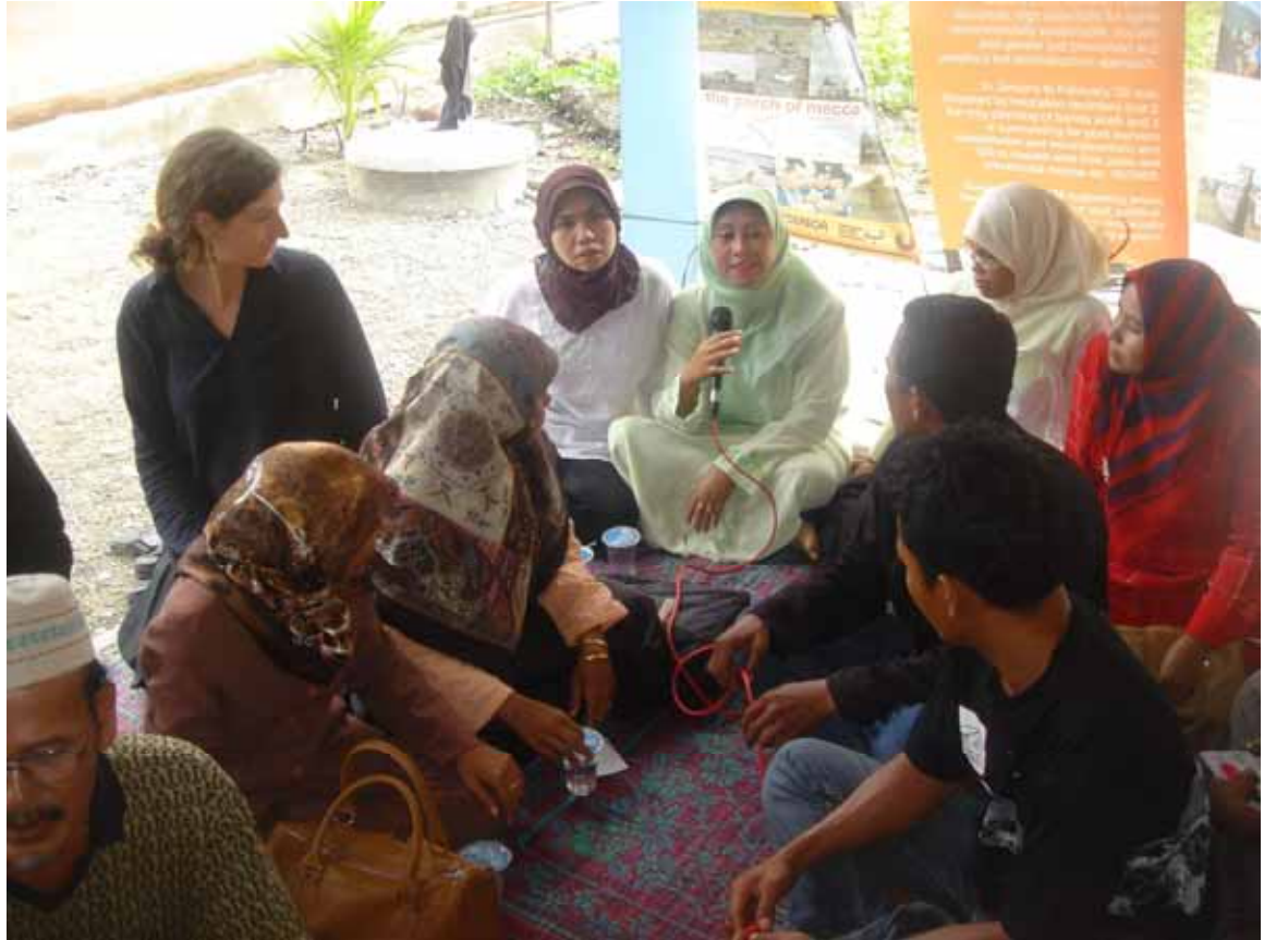
Fig. 12. Resilient tsunami survivors in Aceh describing how they survived the disaster

Gender Factors are of fundamental importance in any consideration of disaster recovery in recognition of the severe vulnerability of women and children, often in their care, as well as the key roles that women play in many societies in maintaining secure livelihoods. This subject explores roles that women can play in recovery management.