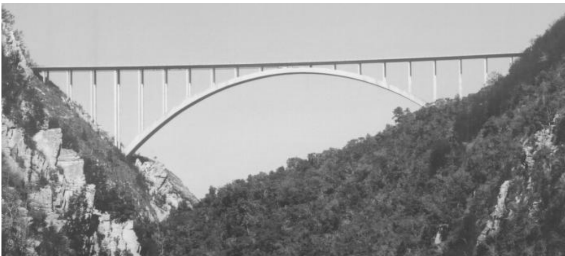
Arch bridge, Garden Route