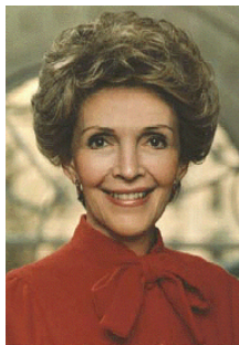
Nancy Reagan 1

Small illustrations with captions to the side: