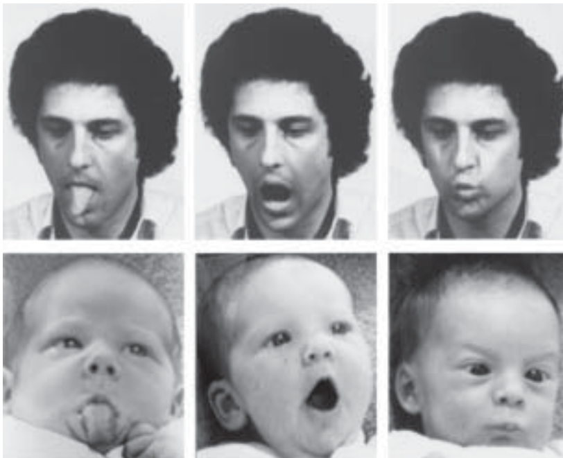
A.N. MELTZOFF AND M.K. MOORE

The results of these experiments provide strong evidence for an extraordinary sensitivity in newborns and young infants to the communicative output of other human beings, and the operation of inherent brain processes in the baby that distinguish human from non-human events. These findings suggest that the range of immaturities and precocities of infants is matched by a range of supportive behaviours provided by