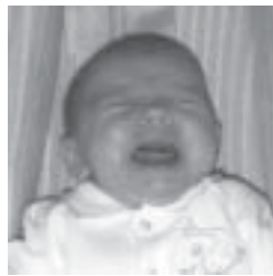
Children's facial expressions of emotional states