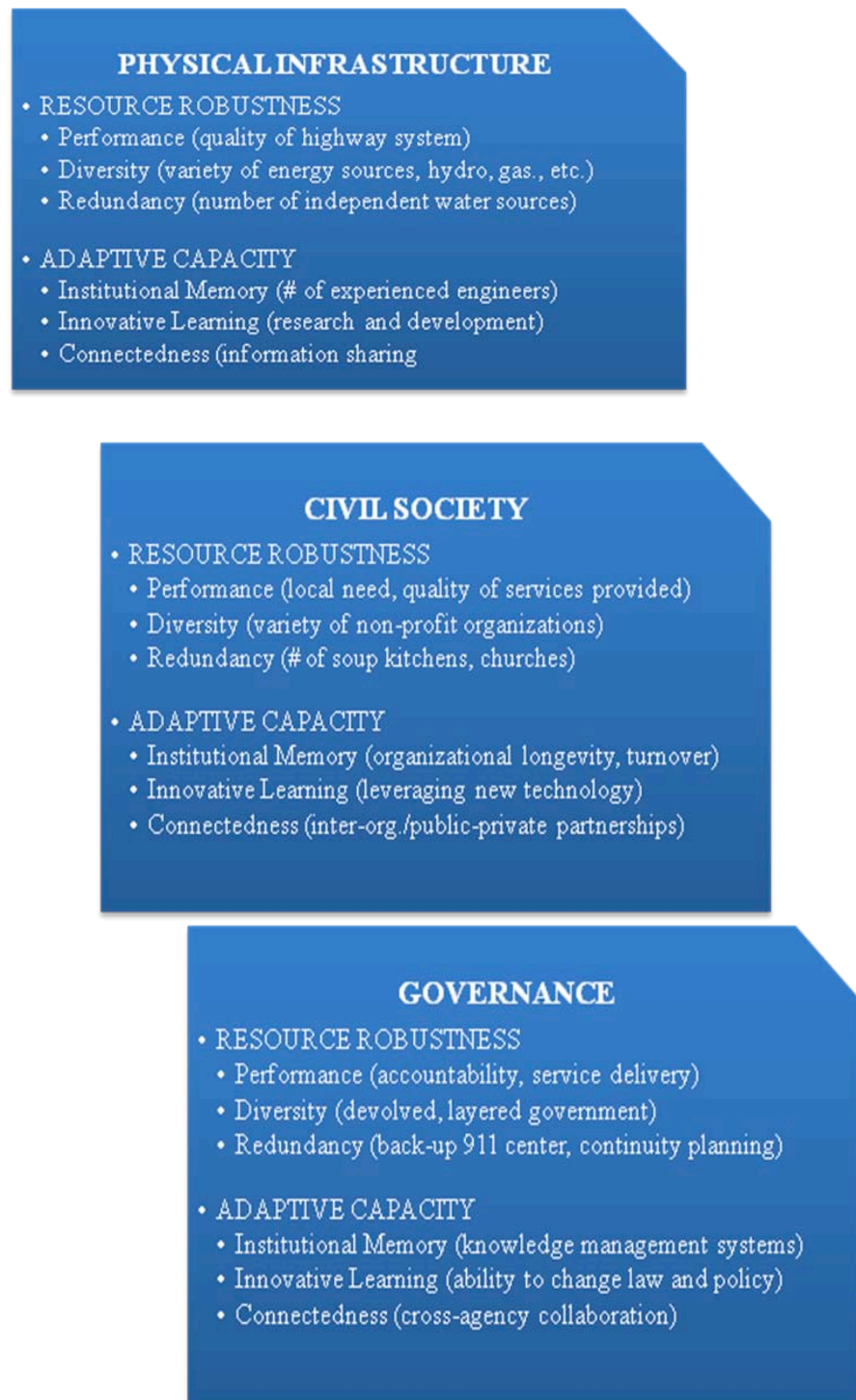
Figure 3. Resilience Analysis Breakdown (with example indicators)