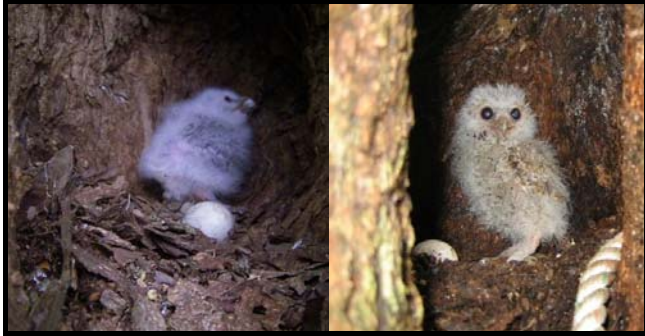
Fig. 11a. Collared Scops Owl chick after being returned to its nest in Sai Kung. Fig. 11b. The same owl chick, two weeks later.

In June 2005, WARC staff were called on a number of occasions to deal with bats that had apparently been washed out of their roof roosts during heavy rain. A bat box was produced and erected near to the roost site to help place bats back in a dry environment. This had limited success, as some bats were young and were not being cared for by adults. It would be interesting to know how widespread this phenomenon is during torrential rain.