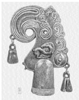
Fig. 6. Poletop in the shape of a bird's head with superimposed imagery and hanging bells. 6th century B.C. Bronze. Rendering by Lynn-Marie Kara. Original in the Hermitage, St. Petersburg

or rather the color treatment of the book, a particular role. . . . Not only the illustrations but the pages of text, too, are colored. . . . Rozanova looks for the inner, emotional interaction between color and word. . . . The 'action' of color invading the figurative fabric of the verse reconstructs the whole book 'organism' along new lines." 28 Rozanova further exploits color to achieve an even greater cohesion of text and illustration in Te li le (1914; pp. 84, 85), one of the crowning achievements of Russian Futurist book design, with its paradigmatic synthesis of painting and poetry.