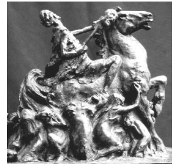
PEACE HALTING THE RUTHLESSNESS OF WAR, 1917: COLLECTION OF CAMILLE O. AND WILLIAM H. COSBY, JR.

Gender issues were critical to Fuller's work as well. She struggled to balance the vicissitudes of being a Black female artist, a wife of a prominent doctor, and a mother of three boys. Motherhood became one of the principal identities from which Fuller could express herself and her opinions about the world in which she lived. In such sculptures as Peace Halting the Ruthlessness of War and Mary Turner: A Silent Protest Against Mob Violence , Fuller used motherhood as a site of radical agency and employed her art for social commentary, condemning violence against women and children.