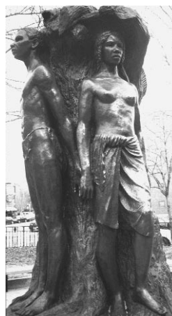
EMANCIPATION, 1913: MUSEUM OF THE NATIONAL CENTER OF AFRICAN AMERICAN ARTISTS, BOSTON, MA

Unlike previous scholarship that has frequently isolated Fuller from significant historical contexts, I positioned Fuller as an active participant in early twentieth-century life. My study began with an examination of the ways that early historians discussed Fuller as a "race artist" and "genius." As I scrutinized the ways in which Fuller and her art were discussed by historians and biographers, I concluded that Fuller's past and her relationship with Auguste Rodin had been mythologized with the full assistance of the artist. Historians constructed Fuller's "genius" in terms of masculinity; they further obscured her gender in favor of highlighting artistic creativity unleashed by the words and touch of the male artist. Tracing her academic training and her Paris exhibitions, I examined Fuller's three years in Paris and the influence of Rodin on her style and subject matter. Because African American artists frequently have been excluded from specific artistic practices, I wanted to emphasize that Fuller was part of a thriving community of sculptors in Paris and owed a deep intellectual debt to the art of Rodin.