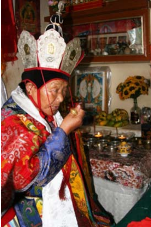
FIGURE 9. A Tibetan medium possessed by a goddess.