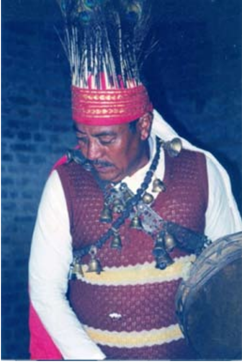
FIGURE 5. A jhākri wearing his specialized ritual costume, headdress, and bell bandolier.