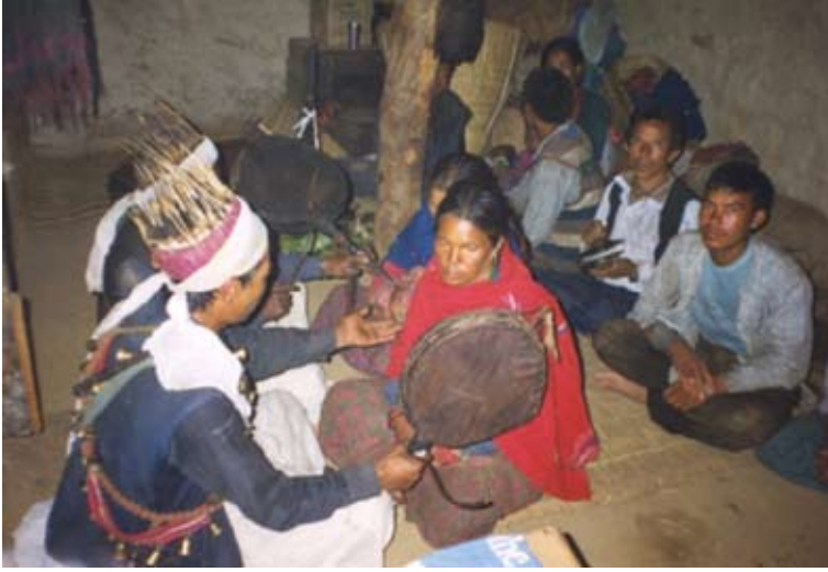
FIGURE 3. A jhākri healing ceremony.

astrologers, 3 New Age savants, and so on, could be classified as shamans. Distinct ritual practitioners are thus needlessly conflated through the use of this approach.