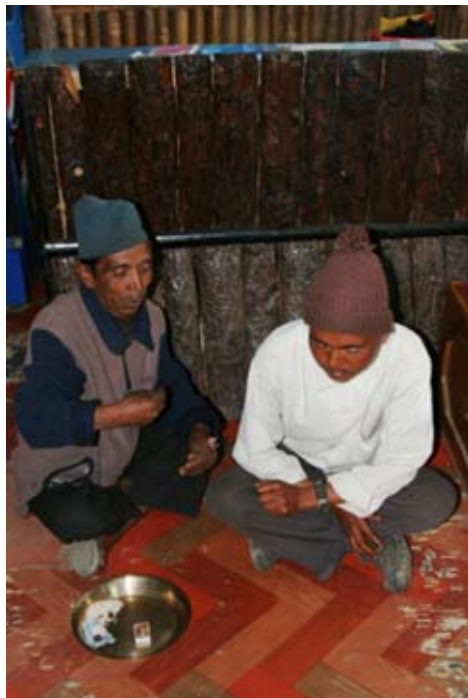
FIGURE 6. A dhāmi fumigating a patient with incense.