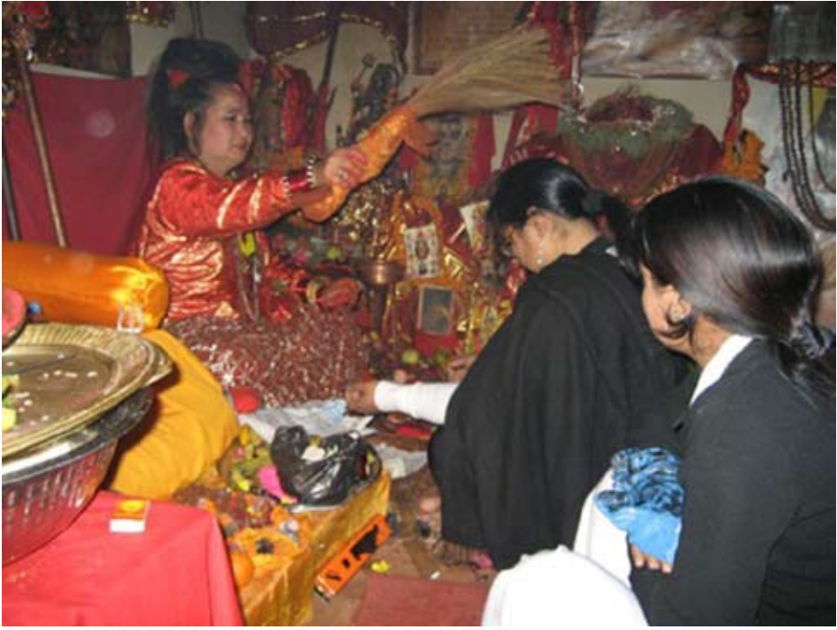
FIGURE 7. A mātā brushing an afflicted supplicant to remove evil influences.

respect to the present discussion. My ethnographic research and the ethnographic studies of other fieldworkers suggest that Nepalese shamanistic practices do display certain minor permutations within particular local cultural contexts (SIDKY 2008, 23). However, the cosmology that underlies it is a pan-Nepalese phenomenon (see ALLEN 1976a, 124 and 1976b, 514; DESJARLAIS 1989, 304; FOURNIER 1976, 118; HITCHCOCK 1976, xii; JONES 1976, 52; MACDONALD 1975, 113; MILLER 1997, 20; ORTNER 1995, 359; PAUL 1976, 145; PETERS 1981, 68; SIDKY 2008, 57–78; TOWNSEND 1997, 441). There is a remarkable unity of belief and practice even though formalized organizations of shamans are absent in Nepal (SIDKY 2008, 23). Other researchers are in agreement. For example, as MILLER (1997, 4) plainly states, these practitioners, “no matter what their ethnic group, all have a basic unity of approach to the world, a world-view, which they share in common with their patients.” Aside from the striking correspondence of beliefs and practices there are also significant similarities in the costumes, the ritual paraphernalia, and specific techniques used by shamans throughout Nepal (see SIDKY 2008, chapters 4–5).