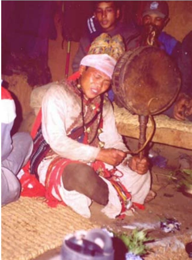
FIGURE 4. A jhākri embodying spirits.

is also problematic because Siberian shamanism did not exclude spirit possession. For instance, as the noted Russian ethnographer Sergei SHIROKOGOROFF (1923; 1924; 1935) reported, spirit possession was a central feature of Tungus shamanism: