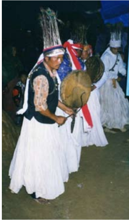
FIGURE 1. A jhākeri in full ritual garb.

ROSE and SCHOLZ 1980; CENTRAL BUREAU OF STATISTICS 2002). The majority of Nepalese subsist by farming and animal husbandry, or agropastoralism.