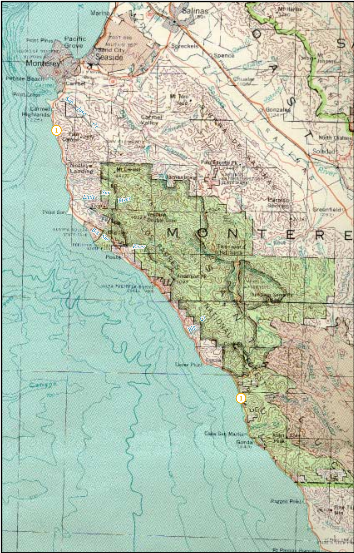
Exhibit 2. Coast Highway 1, from a Portion of USGS 1:500,000 Scale, Northern California Map.