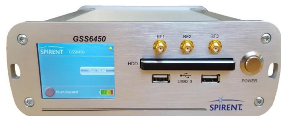
Fig. 2. Front view of Record and Replay System

For every new location or date a new test recording is required. The recorded error conditions captured in the recording are usually unknown, unless the user has additional information about special conditions from external sources, like space weather reports. Test drives and recordings are easy and cost effective for stationary and land vehicle based receiver and allow Software and Hardware testing including system trials, algorithm studies and iterative algorithm development, interference and jamming recording and monitoring.