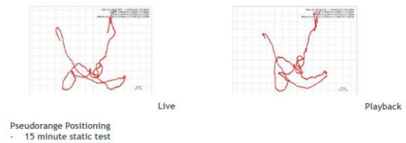
Fig. 3. Comparison of pseudorange position fixes with live sky signals and replayed GNSS signals measured with a Novatel GNSS receiver at 10 Hz update rate. Each grid cell's width and height corresponds to 10 cm [25]

Sampling rates are 10.23, 30.69 or 51.15 MHz, synchronous recording rate for external data is 300 kbps at 10.23 MHz, 900 kbps at 30.69 MHz and 1500 kbps at 51.15 MHz, asynchronous recording rate for external data is 4800-115200 baud. [14] The reference oscillator is an OCXO with a frequency of 10.23 MHz, to allow direct generation of the wanted GNSS frequencies. There are two RF outputs: one normal RF output with a standard GNSS RF signal strength (nominal -130 dBm for GPS L1), and one high power output at the back of the test system with around -80 dBm nominal [14]. In addition there is a 10 MHz Reference IN port, allowing to input a source of precise timing. The better the timing, the better the accuracy of the GNSS Position, Navigation and timing solution.