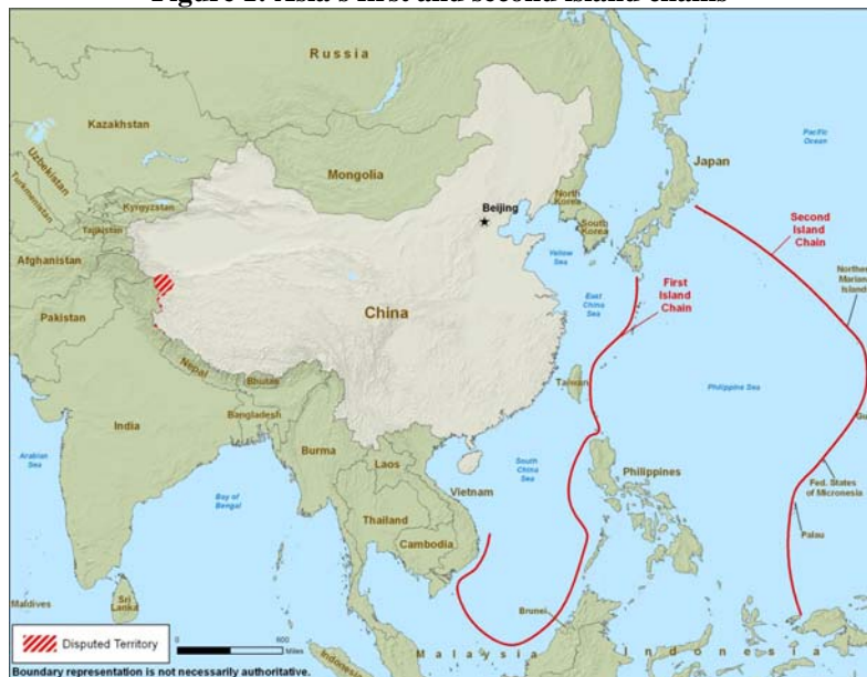
Figure 1: Asia's first and second island chains a

Taiwan also is believed to be of high strategic importance for China, sitting as it does in the middle of the “first island chain” off China's coast (see figure 1).