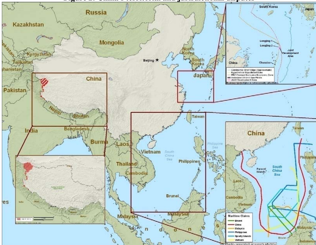
Figure 2: China's territorial and jurisdictional disputes b

Alternatively, China could choose to concentrate on simply securing access to resources and markets against threats from piracy, terrorism, or unstable states, without pursuing territorial claims. Such a choice could lead to conflict with other nations, but it would not necessarily do so. Alternatively, it could provide opportunities for cooperation between China, the United States, and other Asian nations—for example, for joint development of natural resources or joint military patrols of SLOCs.